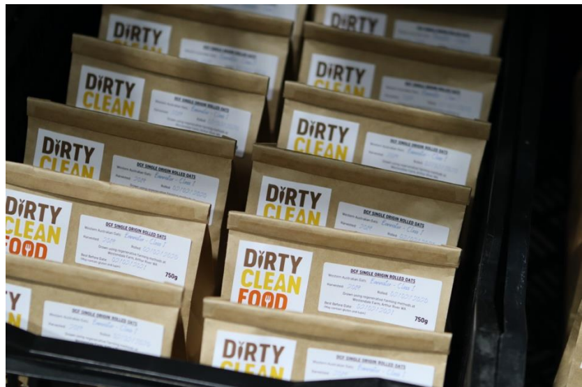
Dirty Clean Food freshly packaged and branded oats now for sale online